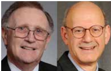
Messages from the President & Executive Vice President