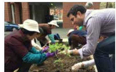
Senior Advocacy & Housing