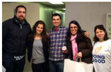
Helping Communities & Disaster Relief