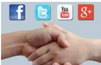
Connecting = Social + Traditional + Personal