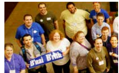
Young Leadership in Action