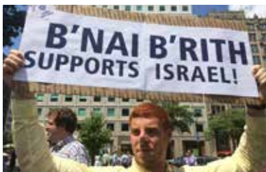
Supporting & Defending Israel