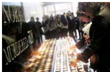
Remembering & Honoring the Past