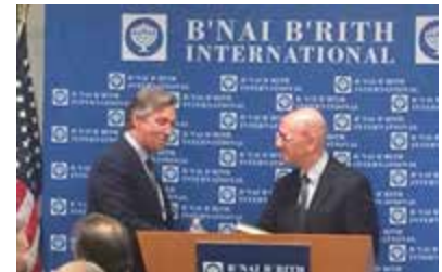
Human Rights & Public Policy