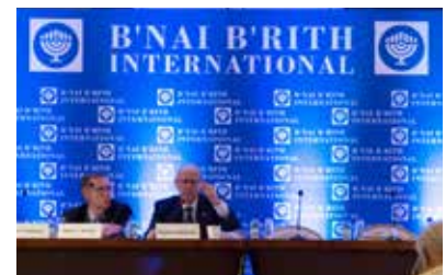
Executive Board of Directors / Board of Governors

B'nai B'rith International has advocated for global Jewry and championed the cause of human rights since 1843. B'nai B'rith is recognized as a vital voice in promoting Jewish unity and continuity, a staunch defender of the State of Israel, a tireless advocate on behalf of senior citizens and a leader in disaster relief. With a presence in more than 50 countries, we are the Global Voice of the Jewish Community.