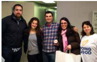
Helping Communities & Disaster Relief