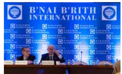
Executive Board of Directors / Board of Governors

B'nai B'rith International has advocated for global Jewry and championed the cause of human rights since 1843. B'nai B'rith is recognized as a vital voice in promoting Jewish unity and continuity, a staunch defender of the State of Israel, a tireless advocate on behalf of senior citizens and a leader in disaster relief. With a presence in more than 50 countries, we are the Global Voice of the Jewish Community.