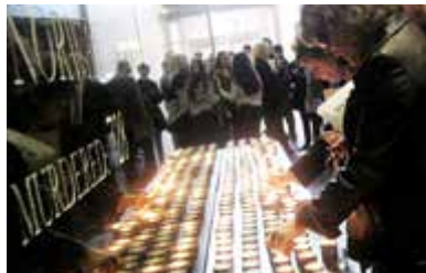
Remembering & Honoring the Past