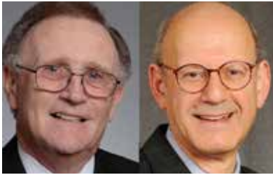
Messages from the President & Executive Vice President