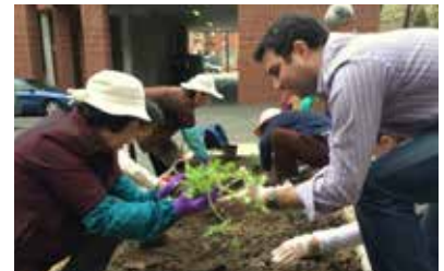
Senior Advocacy & Housing