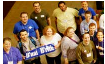
Young Leadership in Action